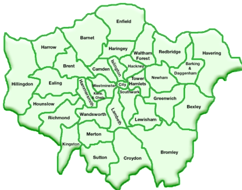
Figure 1: Map of the 32 London Boroughs:

5.2 An all-London boroughs Neighbourhood Planning Group has recently been established. This functions similarly to the ALBPO group and provides a network for information sharing and good practice. It is normally chaired and hosted by Camden Council. Enfield Council planning officers have attended meetings.