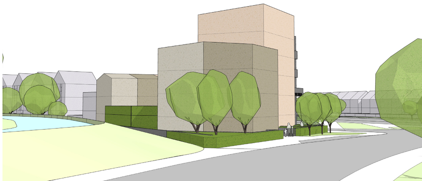
Street view from Bullsmoor Lane looking towards North-east