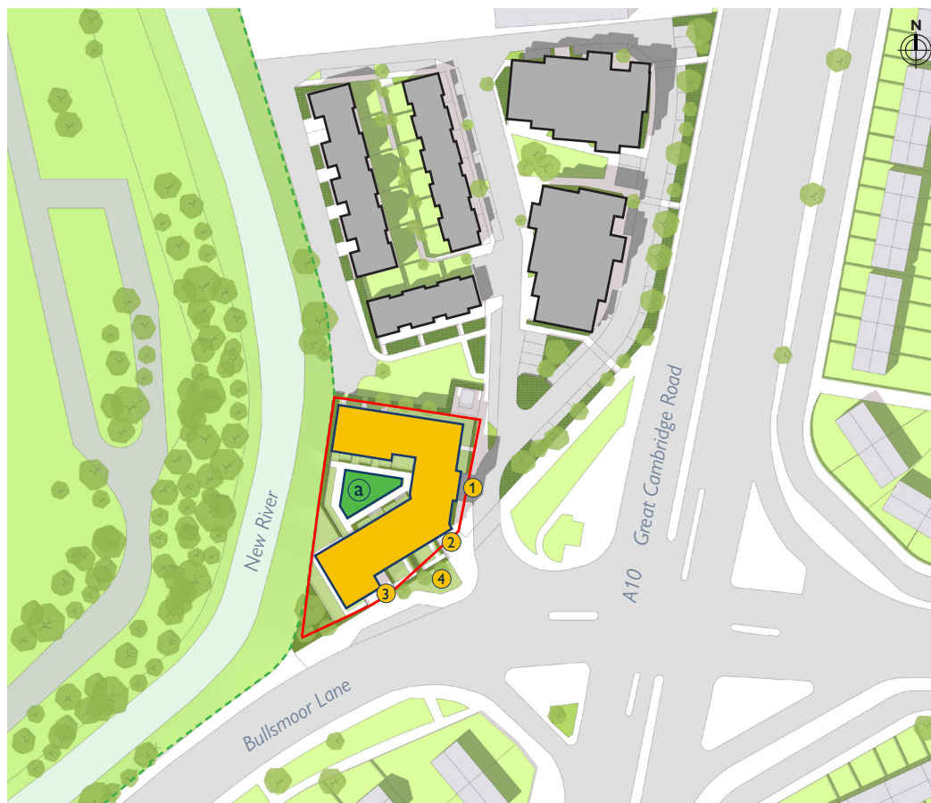
Above: Proposed Site Plan