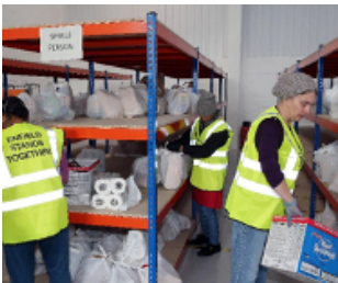
Volunteers in our Enfield Stands Together supply centre

Cllr Nesil Caliskan Leader of Enfield Council