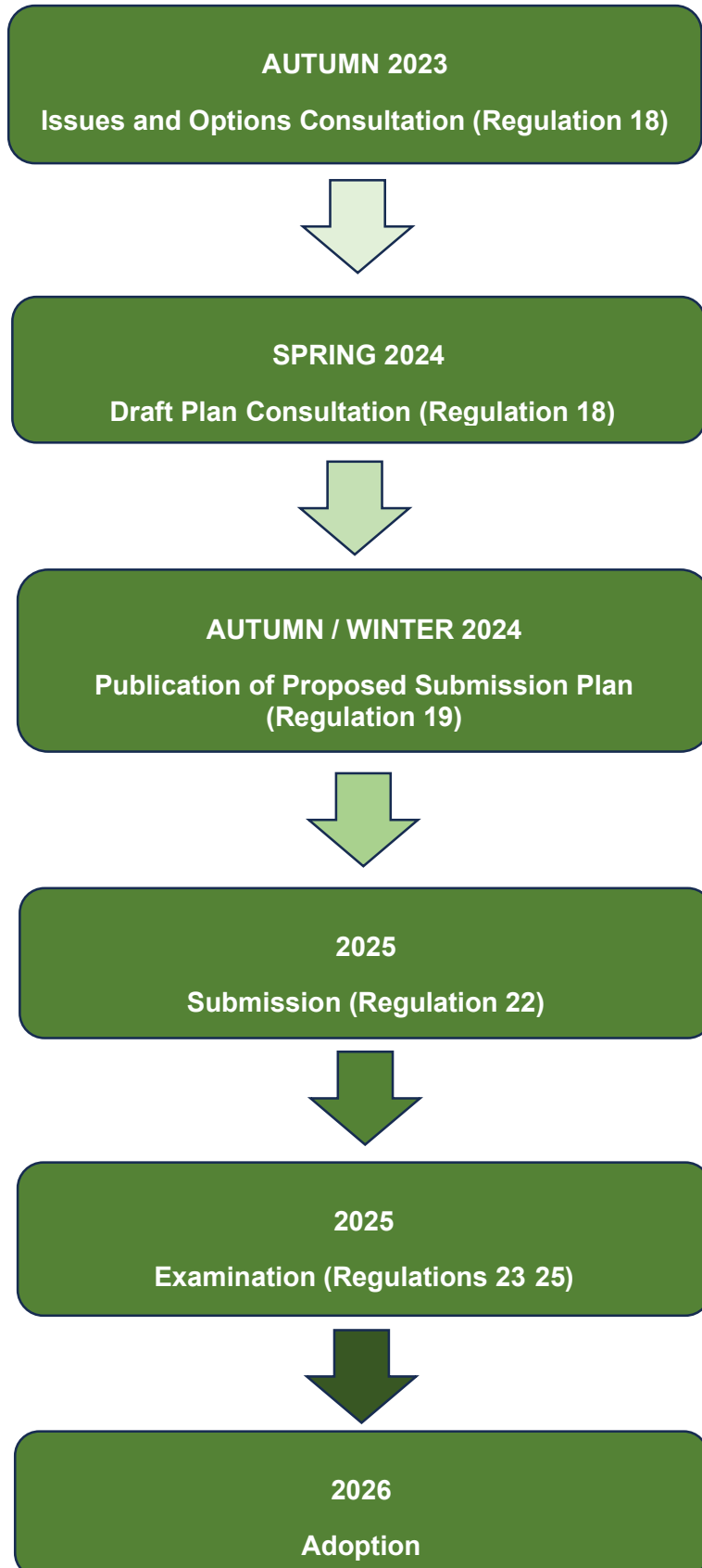
Figure 1: Indicative timetable for the TLP.

1.14 This Issues and Options document is the first formal stage of the TLP process. The diagram below shows how the Issues and Options document fits into the whole TLP plan-making process.