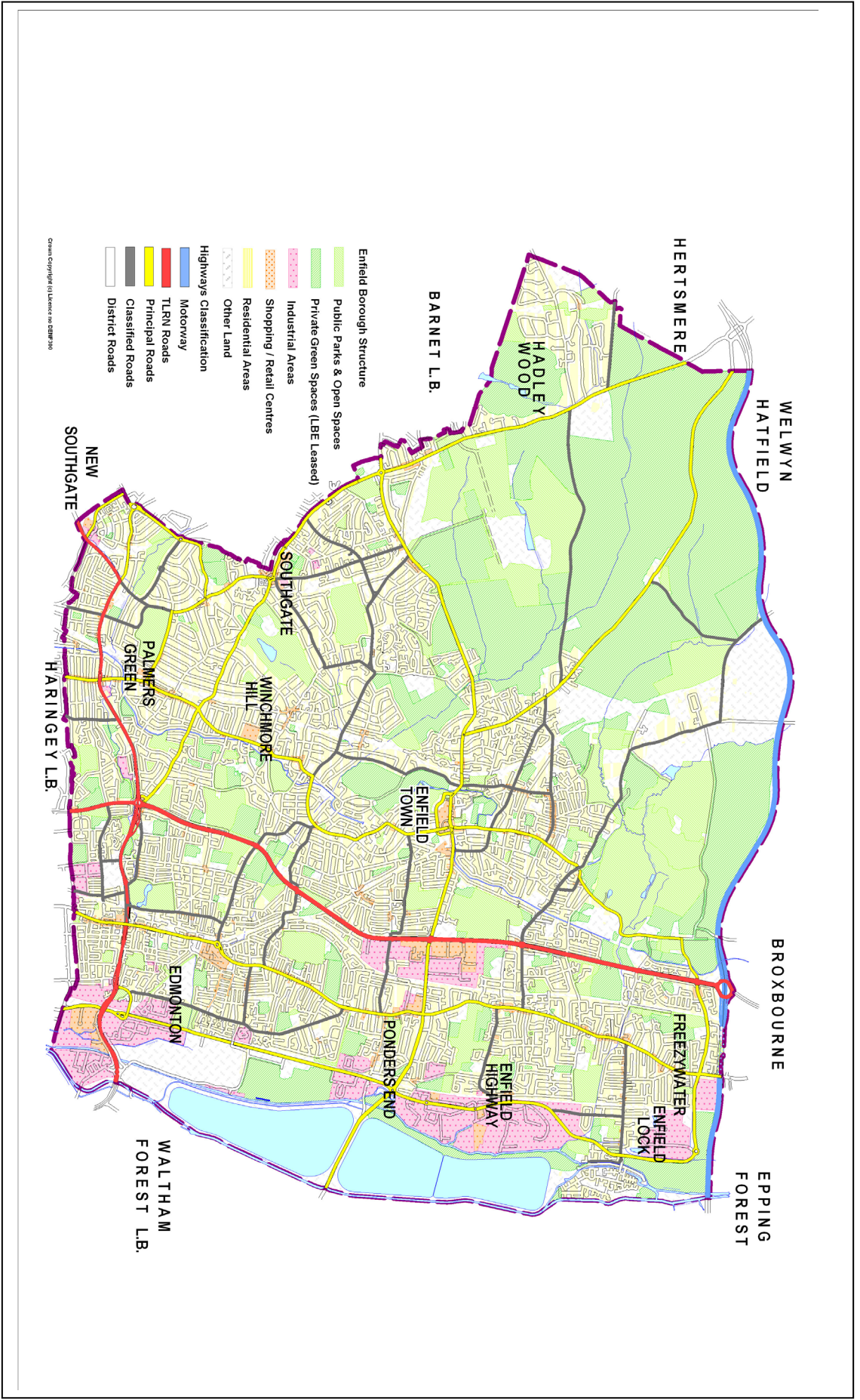
Borough Structure and Highway Classification