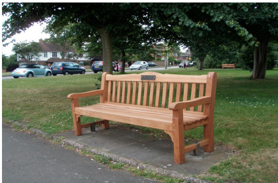
Above Standard Timber Seat

Other types of benches are considered for specific locations, where the use of a standard bench is not appropriate.