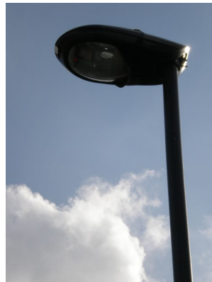
Far left Embellished Lantern