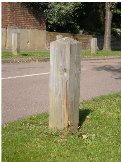
Far left 'Doric' Bollard