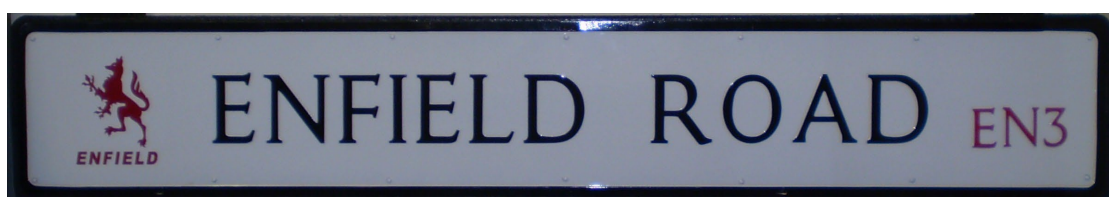
Above Standard Street Nameplate

In conservation areas street nameplates are made from pressed steel to give the wording in relief similar to the traditional cast iron ones. Where original cast iron street nameplates still exist they will be renovated.