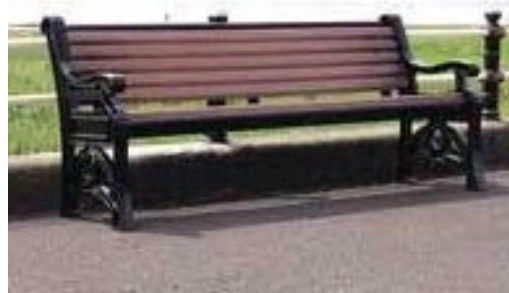
Above Metal Ended Slatted Seat