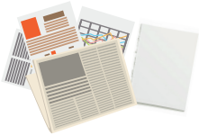
Paper, magazines & newspaper