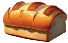
Bread & pastries