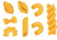
Rice, pasta & beans