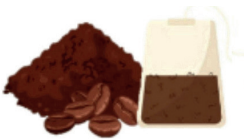
Tea bags & coffee grounds