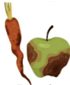
Fruit & vegetables