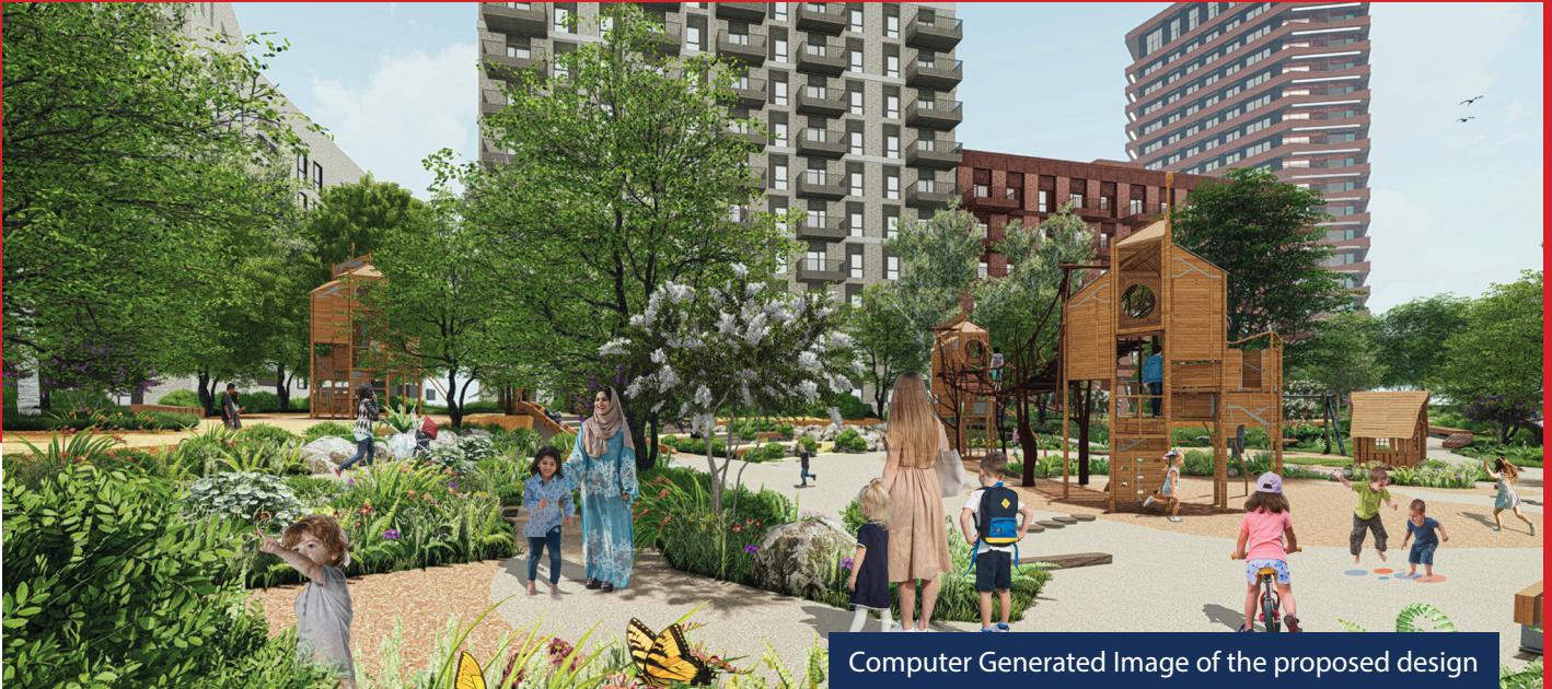
Computer Generated Image of the proposed design

Enfield Council is making good progress with its regeneration proposals. This newsletter is to let you know about opportunities for Joyce and Snell's residents and the local community.