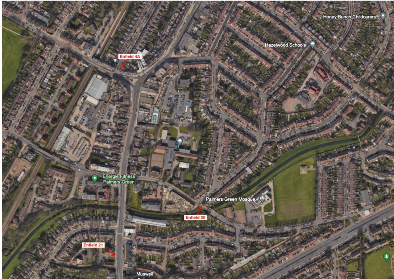
Figure A. Map of Non-Automatic Monitoring Sites